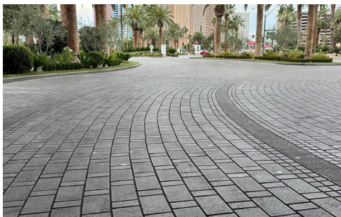
Leveling Bed for Vehicular Pavers

PAIR WITH POLY VBM BONDER FOR USE WITH CONCRETE PAVERS OR NATURAL STONE