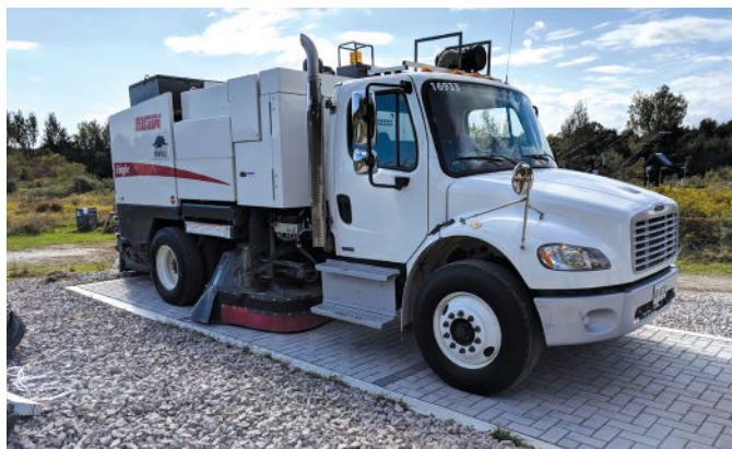
Figure 20. This type of mechanical sweeper removes sediment from joints parallel to the direction of the broom rotation.

Also in 2020 the United States Geological Survey Madison, WI office published results of a four year investigation on cleaning PICP, Assessment of Restorative Maintenance Practices on the Infiltration Capacity of Permeable Pavement Assessment of Restorative Maintenance Practices on the Infiltration Capacity of Permeable Pavement. Since 2014, this research site has collected water quality, temperature, infiltration rates, and surface flow data with three types of permeable pavement sections (pervious asphalt, porous concrete, and permeable interlocking concrete pavement). Contributory drainage from an adjacent parking lot provided an opportunity for accelerate clogging and collect data for 9:1 and 5:1 drainage ratios. The following six pavement cleaning methods were evaluated over a 4-year period: manual cleaning with a masonry trowel; Leaf blower and broom; true vacuum; water-enhanced vacuum; high pressure air system; and pressure washer with soil vacuum. An evaluation of the efficiency of each method was based on comparing surface infiltration rates, pre and post cleaning.