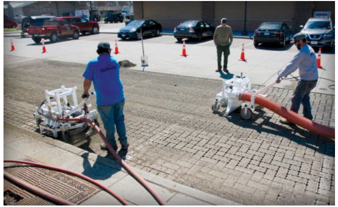
Figure 24. This equipment blows sediment and soiled aggregate from the joints and uses vacuum equipment to remove them.