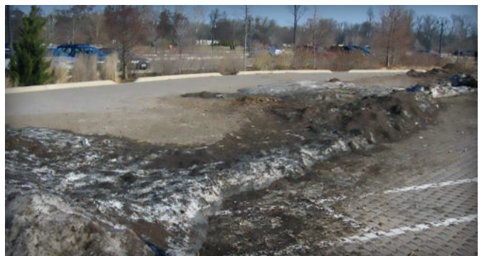
Figure 26. This is an example of snow that should have been deposited on a grassy area. If such areas are not available, then vacuum clean the PICP in the early spring.

A 2020 University of Toronto study on pavement deicing operations quantified some significant winter safety benefits when using PICP. Besides confirming that the use of permeable pavers can eliminate the occurrence of snow melt refreezing and forming black ice, snow and ice can also melt and dry quicker when deicers are used on PICP. More importantly, the research confirmed that a much lower deicing salt application rate is required on PICP compared to impervious asphalt, while still maintaining a high level of slip and skid resistance. The study also demonstrated that PICP systems can attenuate and buffer the release of salt back into the environment, an important finding since there is concern about snowmelt and stormwater runoff environmentally damaging lakes and rivers.