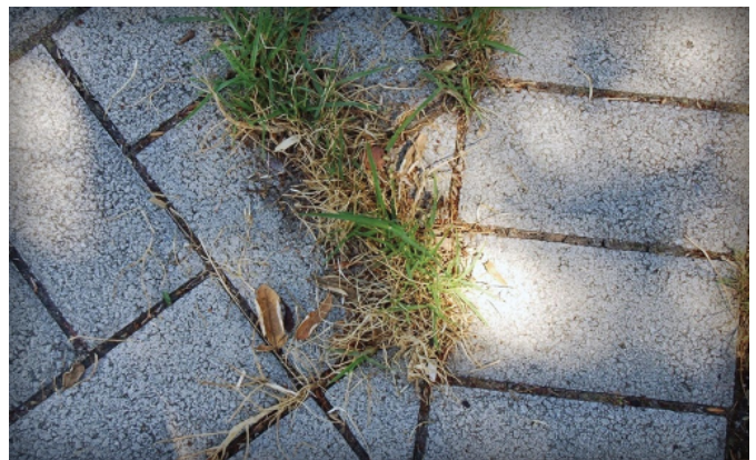
Figure 9. Weeds indicate sediment accumulation and lack of surface cleaning to remove it.

ASTM C1781 test method begins with “pre-wetting” an area inside the ring to ensure the surface and materials beneath are wet. This is done by slowly pouring 8 lbs (3.6 kg) of water while not allowing the head of water on the paver surface to exceed 3/8 in. (10 mm) depth. If the time to infiltrate 8 lbs of water is less than 30 seconds (using a stopwatch typically on a