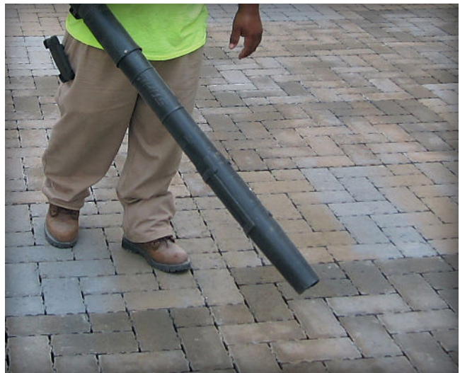
Figure 15. Blowing debris to curbs or gutters for removal and disposal.