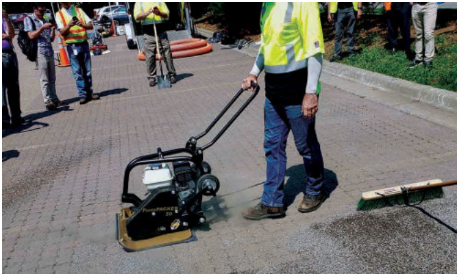
Figure 25. No matter the equipment used, after removing sediment soiled aggregate is placed in the joints, the surfaced cleaned and compacted.

3. As needed —Based on observation and during rainstorms and subsequent surface infiltration tests, remove and replenish the jointing stones and sediment using restorative cleaning equipment and procedures.