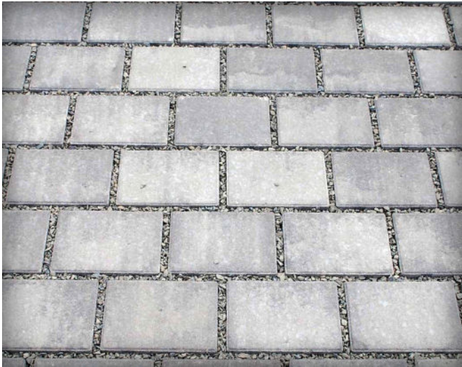
Figure 4. Keeping PICP joints filled with permeable aggregate facilitates removal of accumulated sediment.