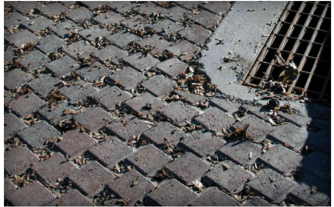
Figures 7 and 8. Pine needles and leaves eventually will degrade and get compacted into the joints from traffic. They should be removed by sweeping or vacuuming before that happens.

than 20% of the entire PICP surface, then surface cleaning should be conducted. While a rainstorm’s exact conclusion is difficult to predict, standing water on PICP for more than 15