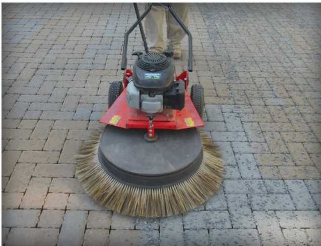
Figure 16. Rotary brushes increase cleaning efficiencies.