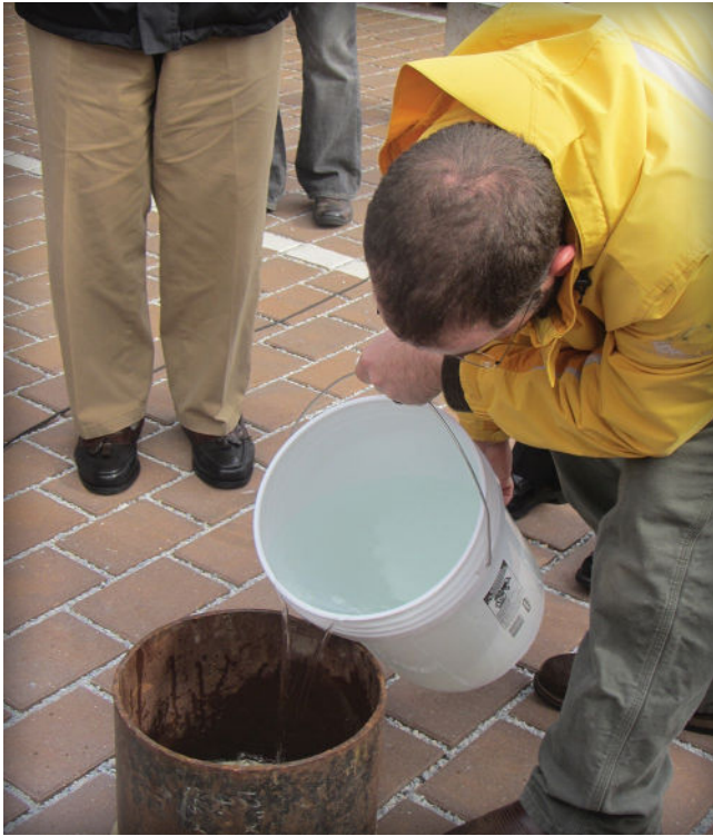
Figure 13. ASTM C1781: pouring the water into a 12 in. (300 mm) inside diameter ring set on plumber's putty.