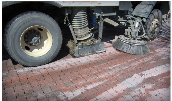
Figure 21. A regenerative air machine does routine cleaning in a PICP parking lot.