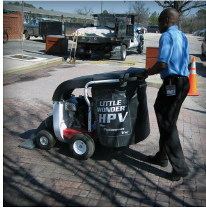
Figure 18. Walk-behind vacuum cleans a small parking area.