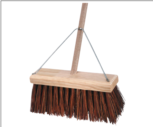
Figure 14. Bristle broom for removing loose debris