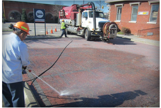
Figure 19. Power washing requires a little practice to minimize jointing stone removal.

restorative cleaning methods, clean jointing stone is spread and the empty joints are filled. After removing excess stones from the surface, the pavers with filled joints are compacted with a minimum 5,000 lbf (22 kN) vibratory plate compactor operating at 75-90 Hz. See Figure 25. This helps settle the stones into the joints. Any joints where stones have settled should be filled with more stones within a 1/4 inch (5 mm) of the paver surfaces.