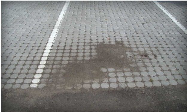
Figure 10. Erosion of adjacent asphalt and sediment deposition on PICP.