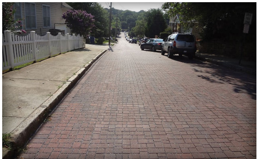
Figure 1. PICP is seeing increased use in municipal streets to reduce stormwater runoff, local flooding, storm pipe upsizing, and combined sewer overflows. These streets are in Atlanta, GA.