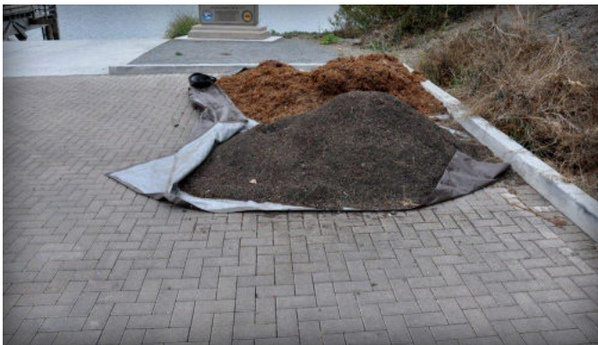
Figure 5. Mulch placed on tarps prevents more expensive cleaning of PICP.

Inspect During and Just After a Rainstorm — The extent of puddles and bird baths observed during and especially after rainstorm indicate a need for surface cleaning. A minor amount of ponding is likely to occur particularly at transitions from impervious pavement surfaces to PICP. This often occurs first as sediment is transported by runoff and vehicles. See Figures 10 and 11. Should ponding areas occupy more