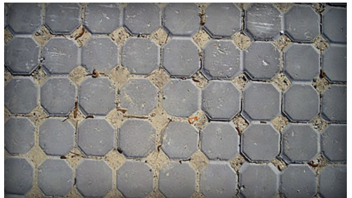
Figure 6. Sand from winter maintenance must be removed the following spring.