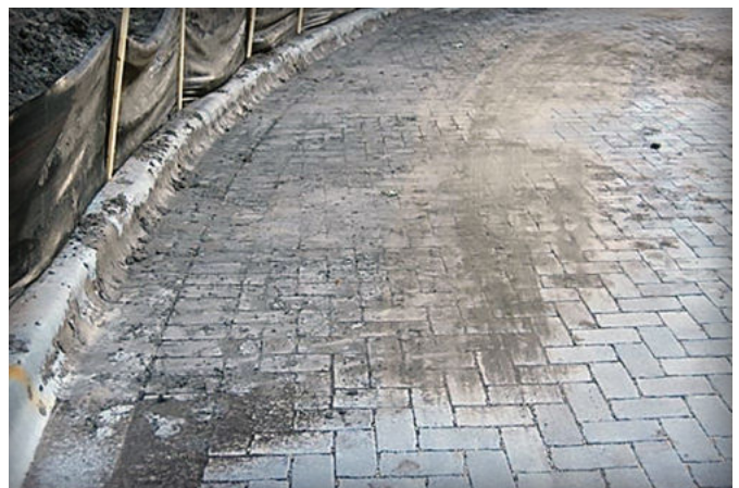
Figure 3. Whether eroded onto or dumped on PICP, erosion and sediment control are essential during construction.

Manage mulch, topsoil and winter sand. Finally, stockpiling mulch or topsoil on tarps or on other surfaces during site maintenance activities rather than directly on the PICP surface helps maintain infiltration. Figure 5 illustrates an example of correct management of landscaping material on PICP, as well as the need to exposed soil slopes.