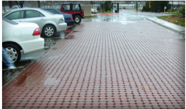
Figure 11. Ponding on PICP typically first occurs at the junction with impermeable pavement.