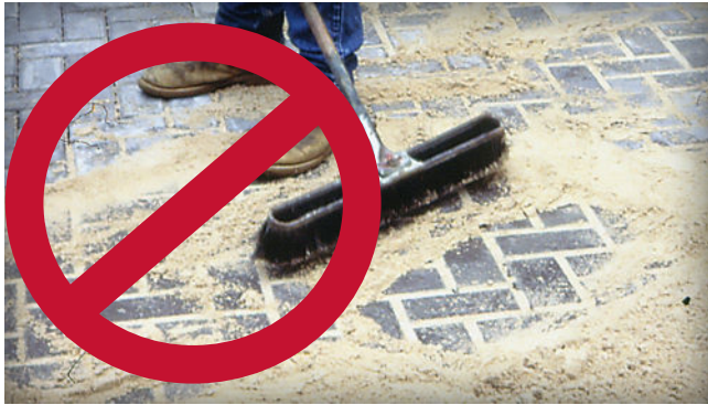
Figure 2. Sand-filled joints and bedding common to interlocking concrete pavement are not used in PICP.

While routine maintenance assures long-term infiltration, surface infiltration can be restored from neglected maintenance. A significant advantage of PICP is its ability to remove settled or wheel-packed sediment in the joints. This Tech Note provides guidance on routine and restorative maintenance practices that support surface infiltration. This bulletin also provides guidance on maintaining the surface as an acceptable pedestrian and vehicular surface.