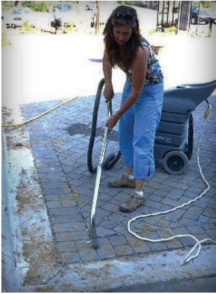
Figure 17. Wet/dry shop vacuum cleans loose sediment from a PICP residential driveway