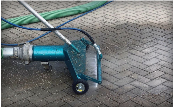
Figure 23. This equipment provides combined washing and vacuum of unmaintained PICP.