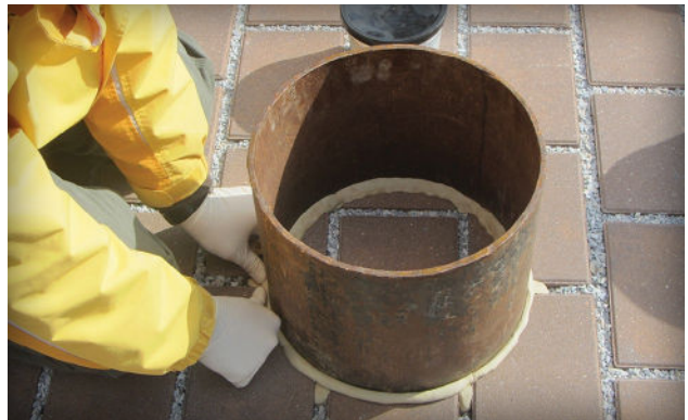
Figure 12. Steps in setting up test equipment for measuring surface infiltration using ASTM C1781.

cell phone), the subsequent test is done using 40 lbs (18 kg) of water. If more than 30 seconds, then 8 lbs of water is used in the subsequent tests. Again, a \frac{3}{8} in. (10 mm) head is maintained during the pour while being timed with a stopwatch. The surface infiltration rate is calculated using formulas in the test method.