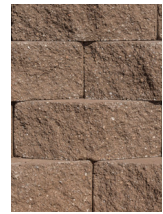
Otay Brown (LGR 6 Only)