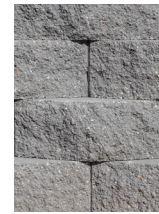
Charcoal (LGR 6 Only)