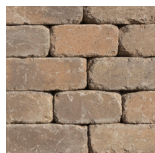
Tuscany (AB Courtyard + Multi + KS Country Manor)