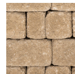
Positano (KS Country Manor Only)