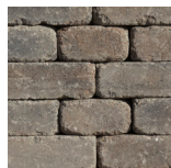
Borrego (AB Courtyard + Multi)