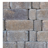
Versante (AB Courtyard + KS Country Manor)