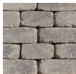
Manor (AB Courtyard + Multi)