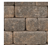
Modena (KS Country Manor Only)

Visit ORCO.COM for the latest information regarding new products. Any mortarless wall greater than 36" in height will likely require a permit. ORCO assumes no liability for improperly built walls. ORCO manufactures mortarless landscape wall block to meet or exceed the standards stated in the latest edition of ASTM C1372. Excludes cap, capstone, and multi stone. For walls taller than 36", ORCO strongly encourages using the National Concrete Masonry Association's (NCMA's) segmental retaining walls best practices guide for the specification, design, construction, and inspection of SRW systems, which is available at no charge from NCMA.ORG . For smaller projects, refer to NCMA's design manual. All measurements approximate. Always verify color and texture with actual samples.